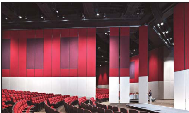
Although the panels range in height to 32', they can be easily moved into position when needed or stored in a nearby pocket when the entire facility is used. The panel finish matches the permanent walls.

Floor seals follow the slope of the floor and are easily extended or retracted with a removable handle.