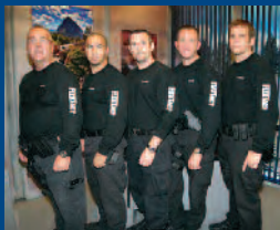
40 Hour Training Program

The Hufcor FlexTact® systems are represented globally by Action Target, a leader in live fire shooting ranges, targets and supplies.